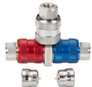
Mott Flow Splitter

Our customer now saves critical hours in the work week. Instead of cutting PEEK tubing, verifying flow rates and attempting to maintain outdated or homemade splits, that time can now be spent focused on collecting maximum data density and reviewing results when providing reports to stakeholders for critical company decisions.