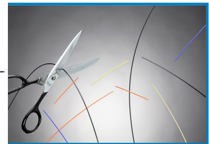
DIY PEEK Tubing Splitter