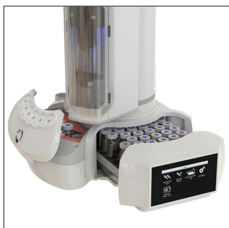
Vial loading in the oven