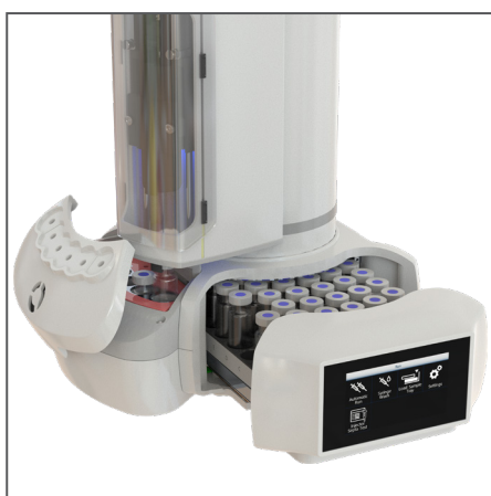
Vial unloading after conditioning