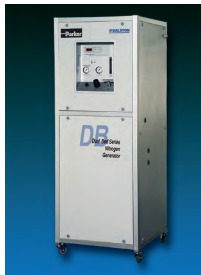
Parker Balston Dual Bed Nitrogen Generators

Parker Balston® Monobed Nitrogen Generators produce up to 99.95% pure, compressed nitrogen at dew-points to -70°F (-21°C) from nearly any compressed air supply. The generators are designed to continually transform standard compressed air into nitrogen at safe, regulated pressures without operator attention.