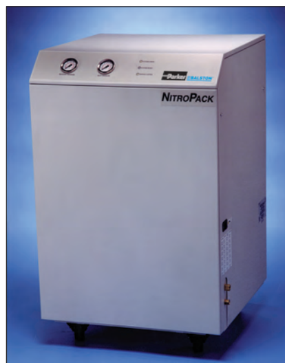
Model 76-98NA Nitrogen Generator

The Parker Balston® 76-97NA and 76-98NA UHP Nitrogen Generators can produce 5-12 lpm of ultra high purity nitrogen gas. These systems are completely engineered to transform standard compressed air into 99.9999% of 99.995% pure nitrogen, exceeding the specification of UHP cylinder gas and dewars. Nitrogen is produced by utilizing a combination of state-of-the-art purification technologies and high efficiency filtration. Pressure swing absorption is utilized for the removal of O 2 , CO 2 , and water vapor. A catalyst module is incorporated in the 76-98NA to oxidize hydrocarbons from the inlet air supply. The generators also have a combination of high efficiency prefilters and a