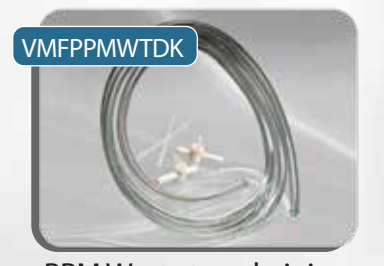
PPM Waste tray draining kit: 10 ft tube and stopcock