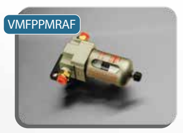
Replacement in line air filter