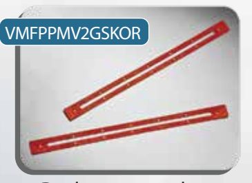
Replacement column sealing gasket (orange)