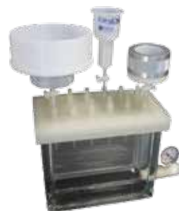
SPE Vacuum Manifold