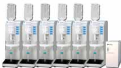
SPE-DEX 4790 Automated Extraction System