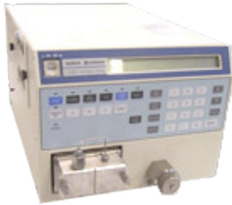
L6200/L6200A 655, L-600, MORE