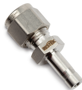
RAVE+ Guard: Stainless Steel