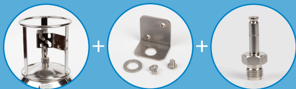
Bracket for Restek cans only.