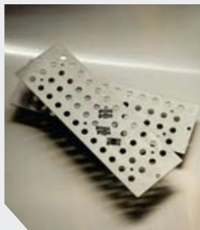
Adaptor extraction plates for 3mL columns Part#: VMFPPMRKA3