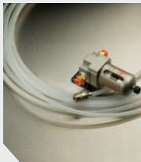
Installation kit (contains 25'1/4" O.D. tubing, in line air filter, 2-1/4" compression fittings, one (1) set of gaskets Part#: VMFPPMIK