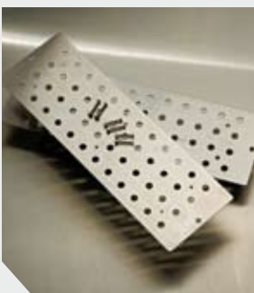
Adaptor extraction plates for 1mL columns Part#: VMFPPMRKA1