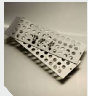
Adaptor extraction plates for 6mL columns Part#: VMFPPMRKA6