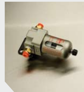
In-line air filter Part#: VMFPPMRAF