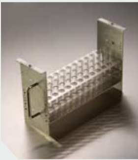
Collection rack for 13 x 100mm test tubes Part#: VMFPPMCRKG13