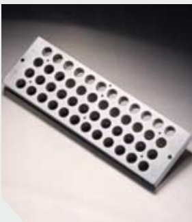
10mL / 15mL extraction plates Part#: VMFPPMRK10