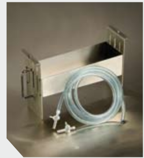
Pre-drilled waste container Part#: VMFPPMWBW